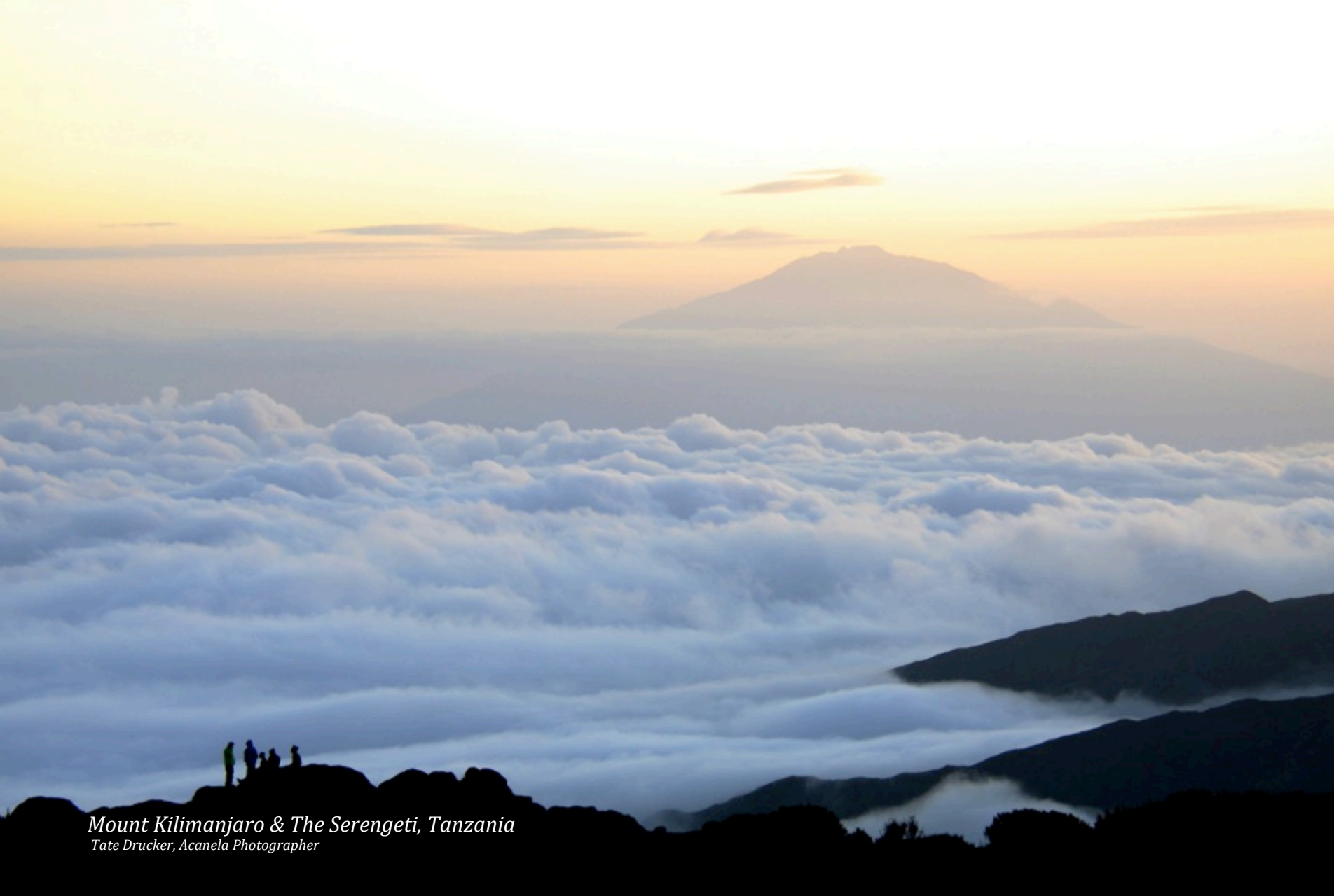
Mount Kilimanjaro & The Serengeti, Tanzania