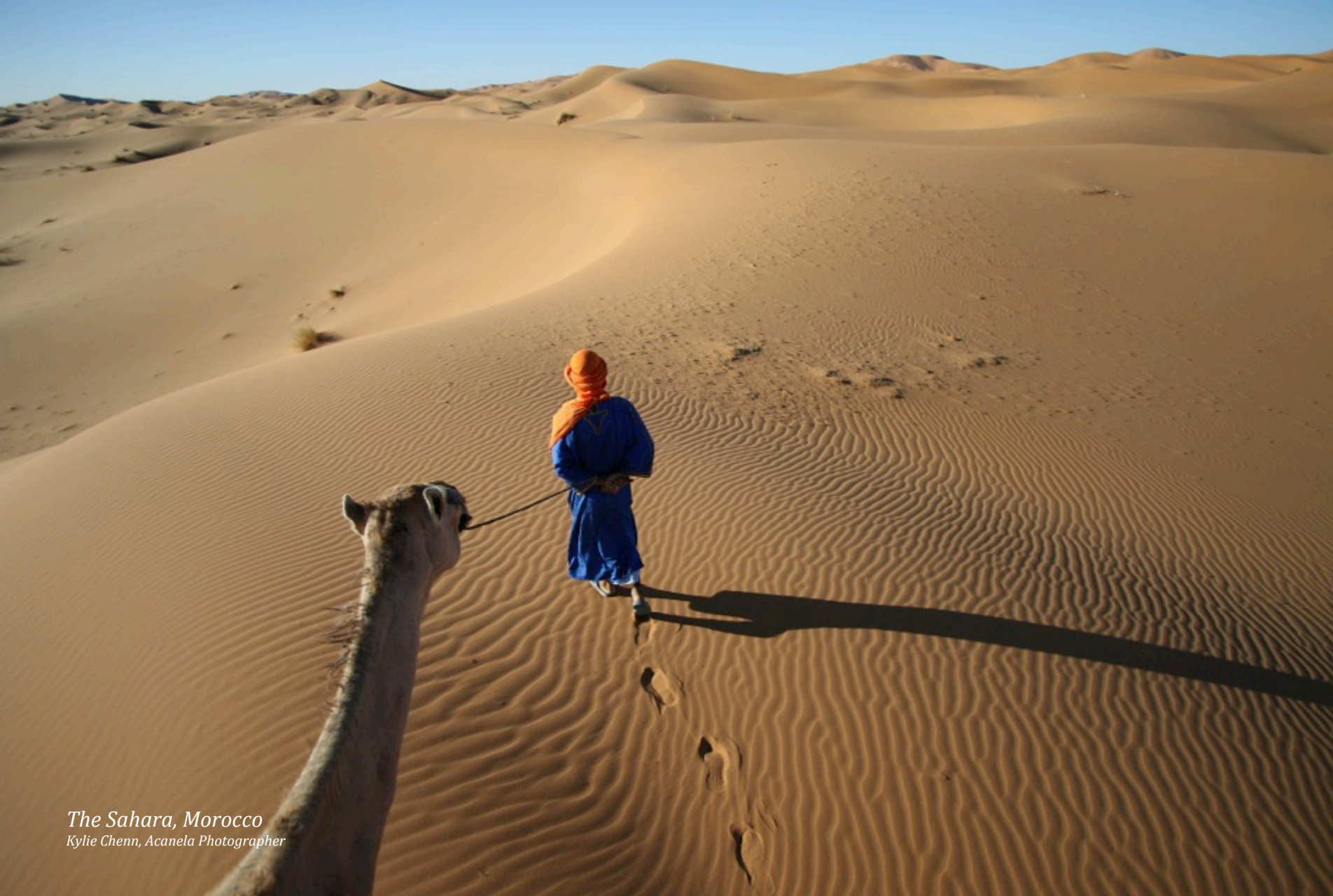
The Sahara, Morocco