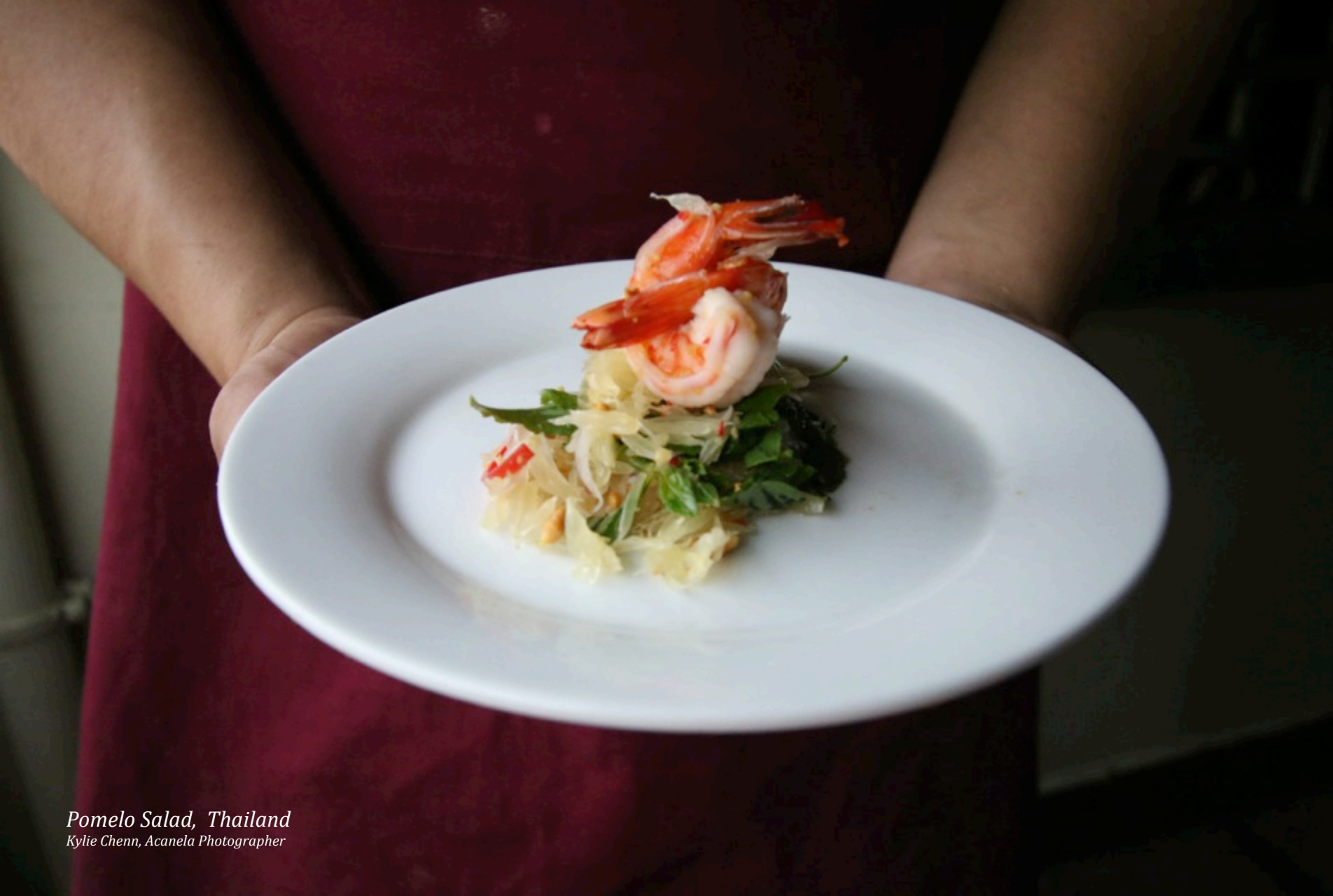
Pomelo Salad, Thailand