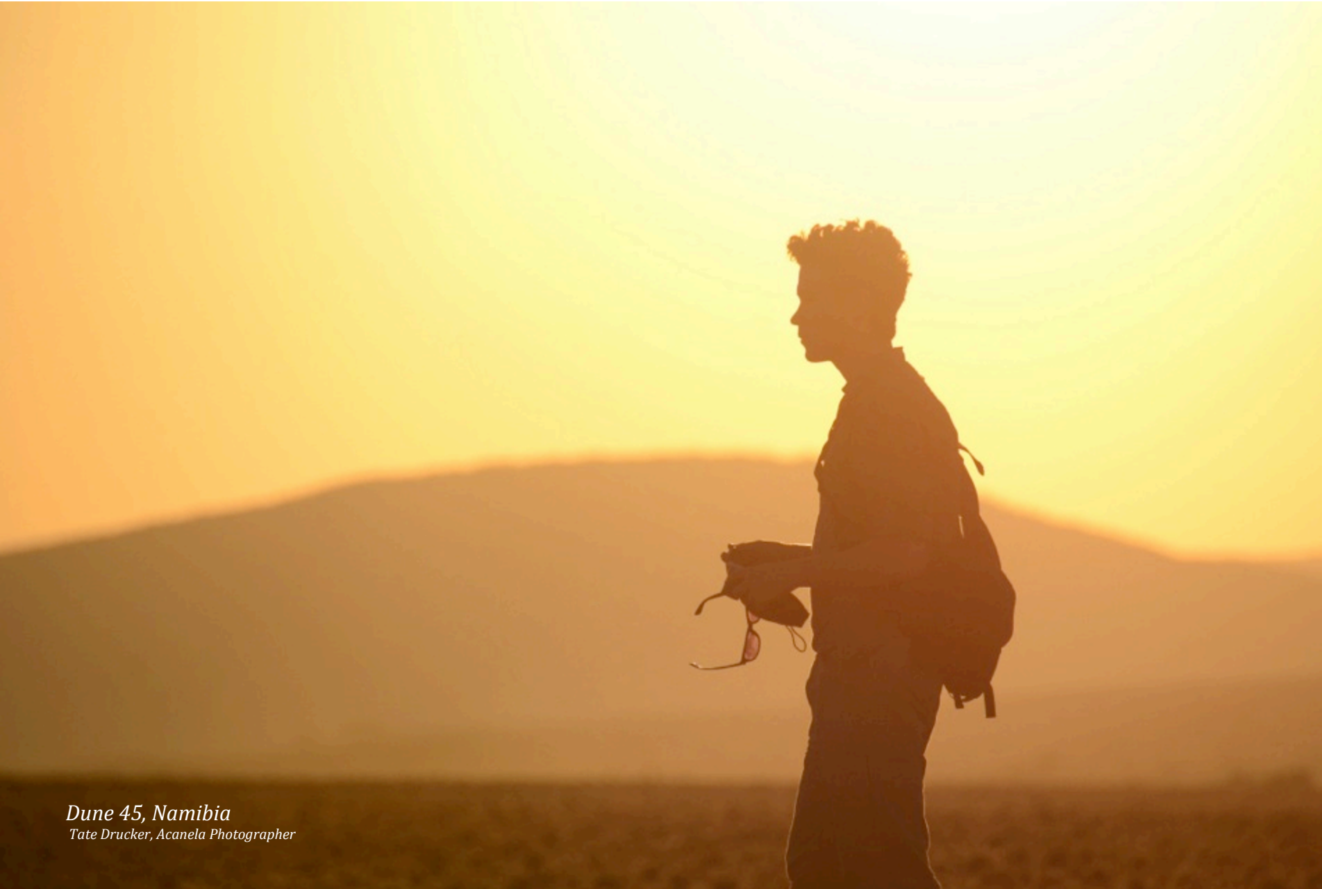
Dune 45, Namibia

Offering unique trips to over 80+ countries, Acanela inspires people of all ages to live a life of adventure by experiencing diverse cultures, landscapes, and cuisines across the globe. All of our travels encompass deep cultural experiences, hands-on adventure, impact opportunities, and excellent cuisine – all necessary pieces of an amazing time abroad.