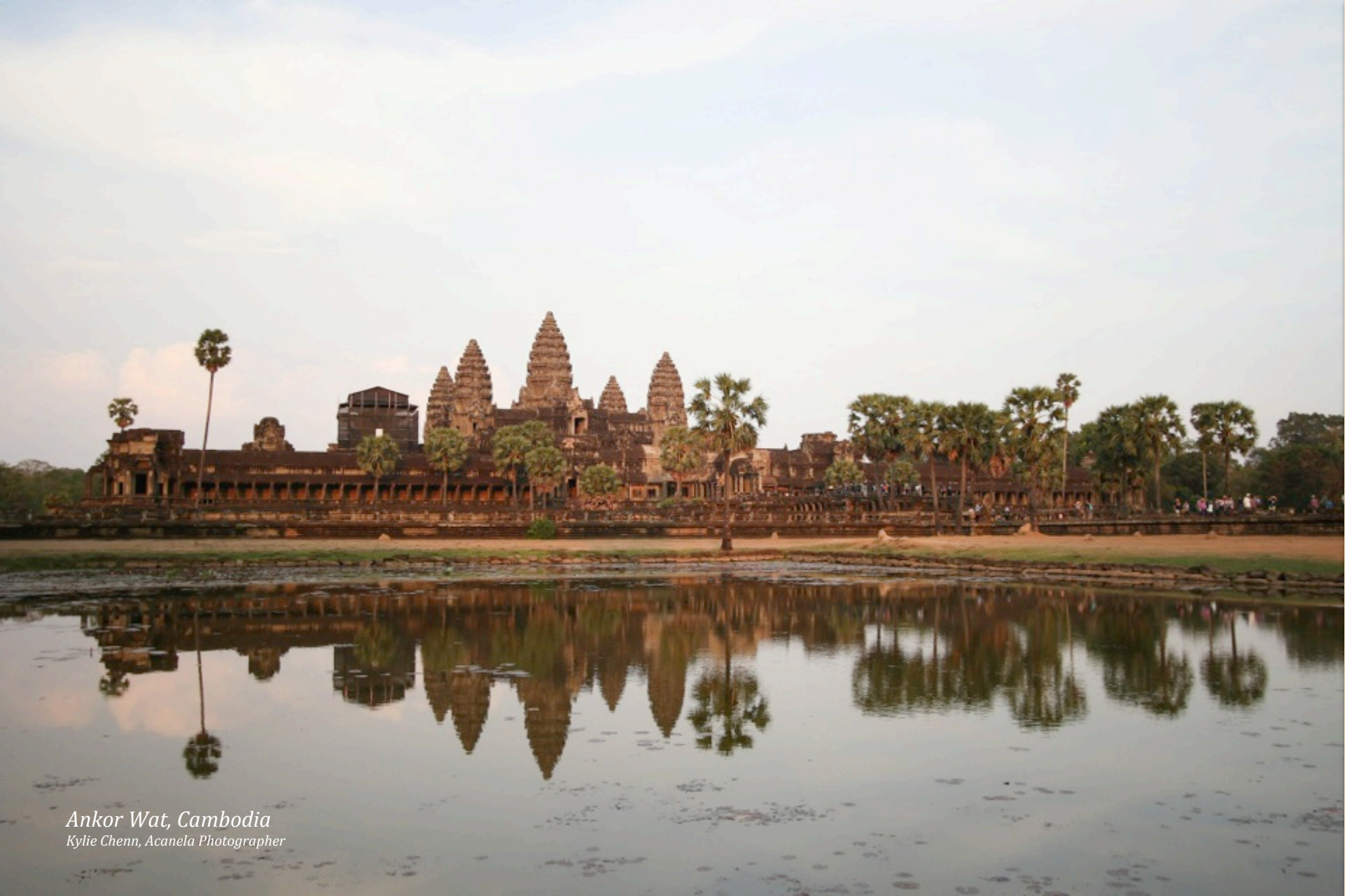
Ankor Wat, Cambodia